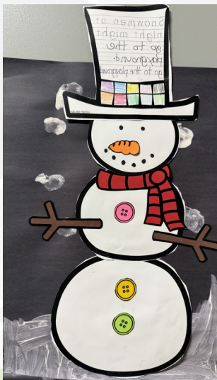
Snowmen at night might...(KM)