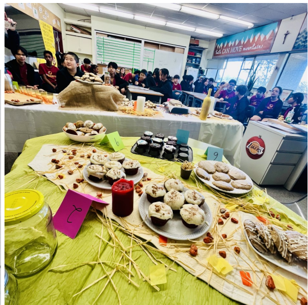
The Great Pumpkin Bake-Off: Grade 7 Serves Up Sweet Pumpkin Delights

We request pick up on Dec. 13 by 5:15 due to our staff Christmas party. Thank you!