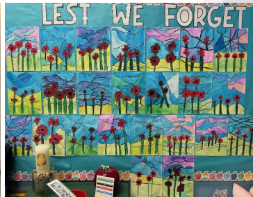
A field of poppies by Grade 3