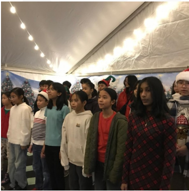
St. Mary's Choir sings at the CBLA Tree Lighting