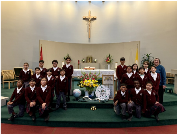
Grade 4C prepared a special Remembrance Day Mass

The goal of Catholic Education is heaven, but knowledge alone will not get us there! "Virtues in Practice" is helping us to live our faith everyday. St Mary, pray for us!