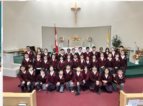
Grade 4C and 4Q led a touching Remembrance Day Service